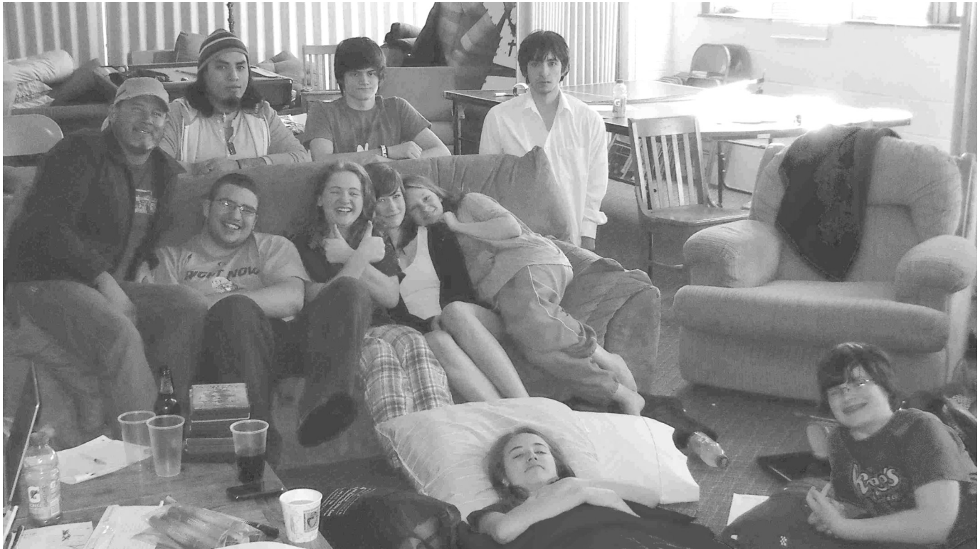
Enjoying a light moment while watching “Fam Cam” video at the 30-Hour Famine fundraiser